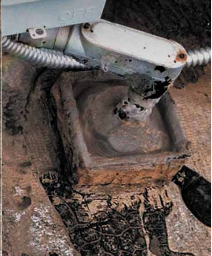
Shrunken "Bird Bath" Pitchpan