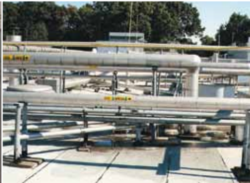
Excessive Roof Loading